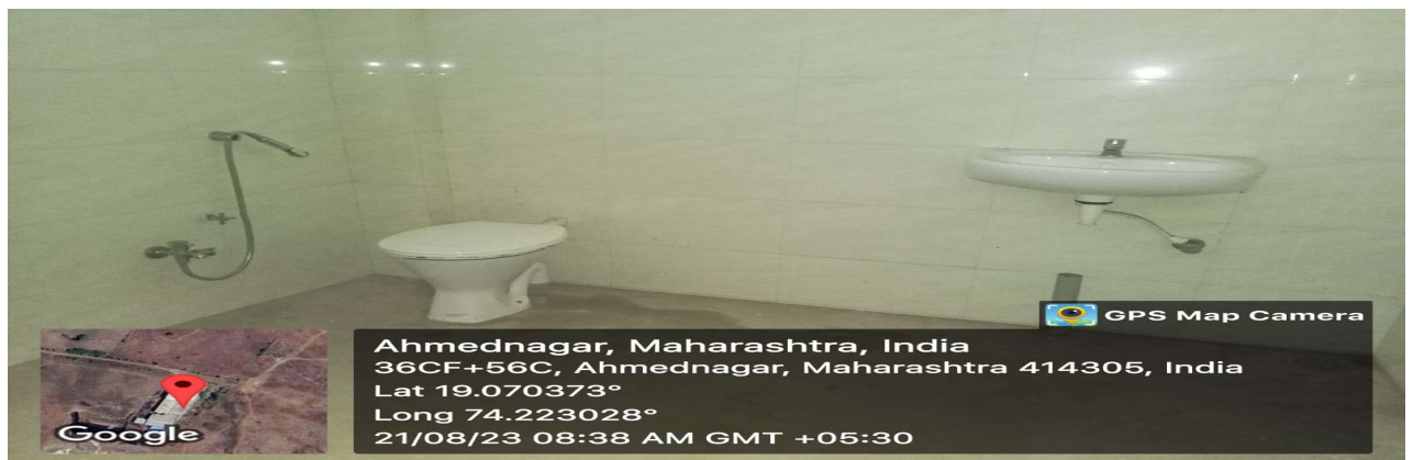
Washroom for Physically disabled students