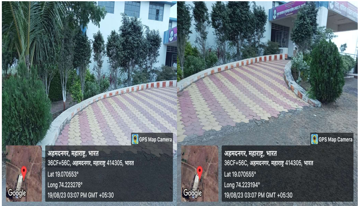
Ramp for disabled students