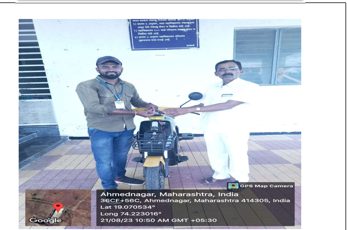
Felicitation of students for maintenance of green campus by using Battery Powered Vehicles