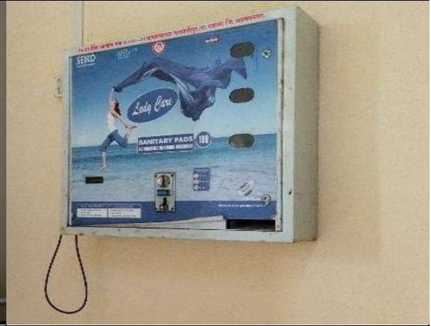
Girls common room with Automatic Vending Machine