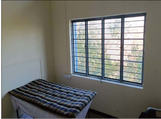
Girls common room

Our institute has a girl's common room . It also includes first aid box, suggestion box, and one study table with two chairs, sick room with Automatic Vending Machine.