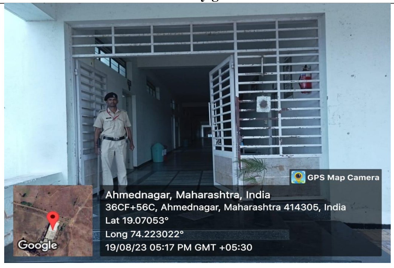
Security gate Watchman