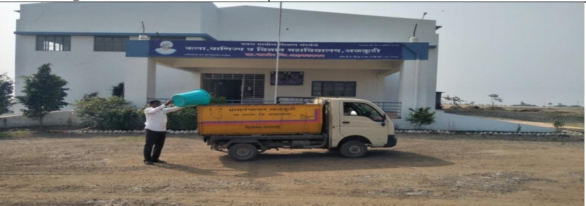
Collection of Solid waste by Grampanchayat