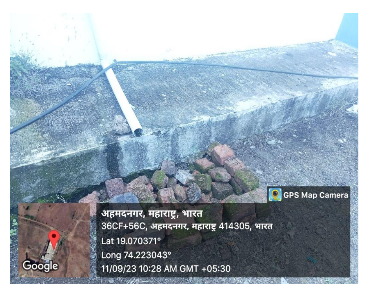
Management of liquid waste from laboratories