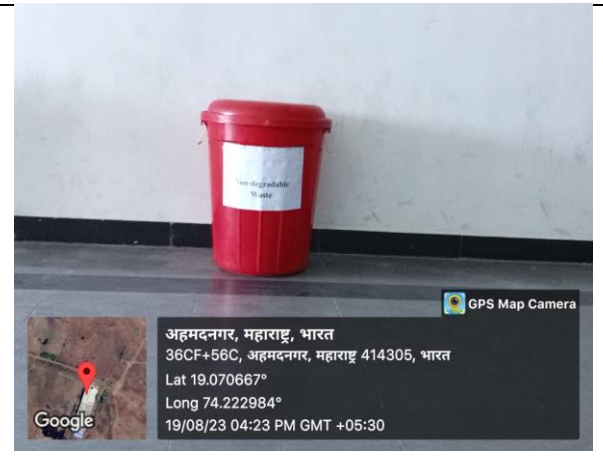
Red dustbin for collection of and Nondegradable waste