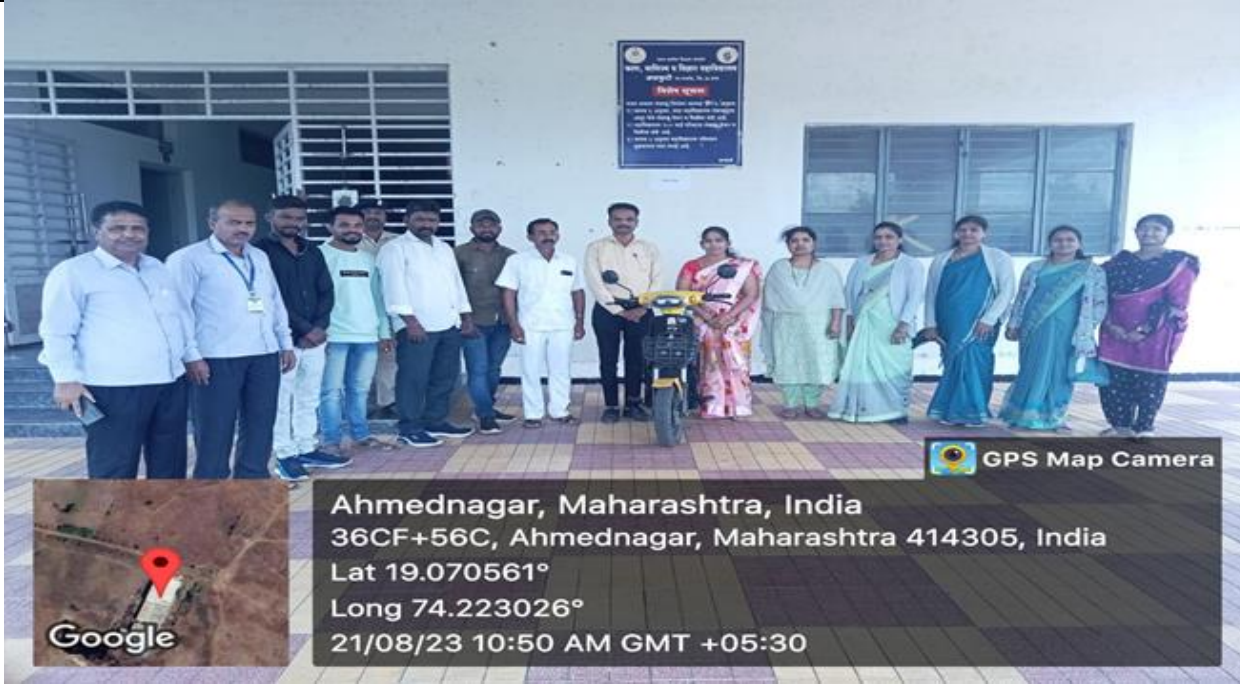
Felicitation of staff members for maintenance of green campus by using Battery Powered Vehicles