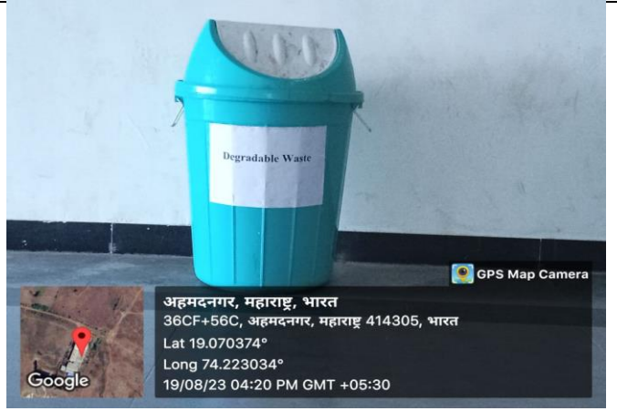
Blue dustbin for wet and degradable waste