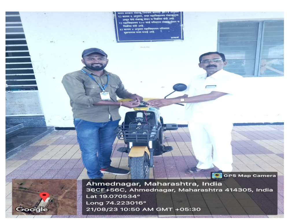
Felicitation of students for maintenance of green campus by using Battery Powered Vehicles