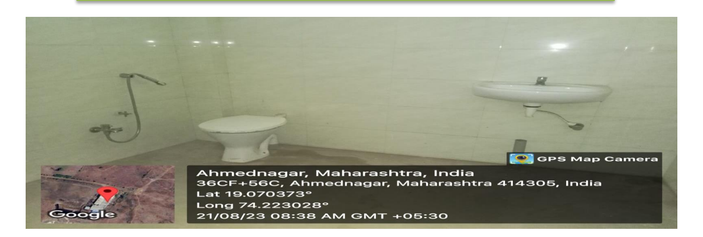
Washroom for Physically disabled students