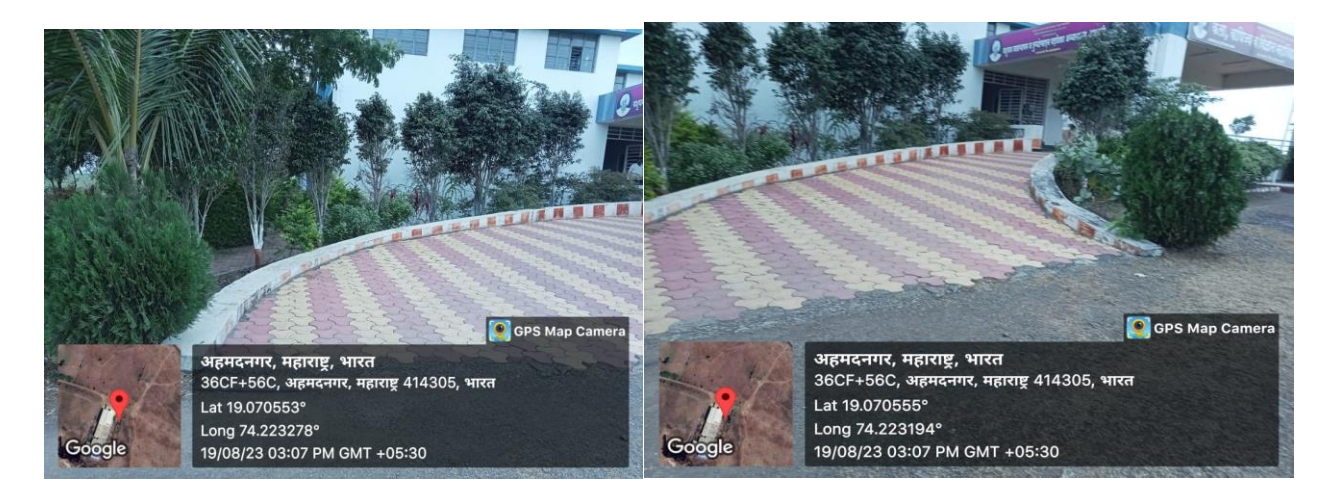
Ramp for disabled students