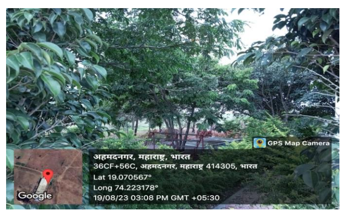
Landscaping with trees and plants