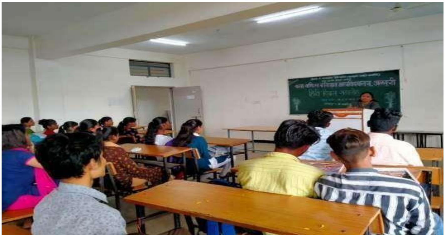
Hindi Day Programme