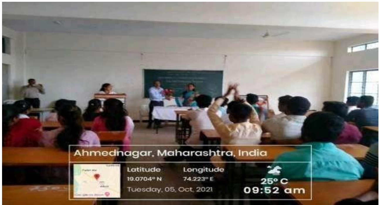
Chief Guest Felicitation Ceremony.