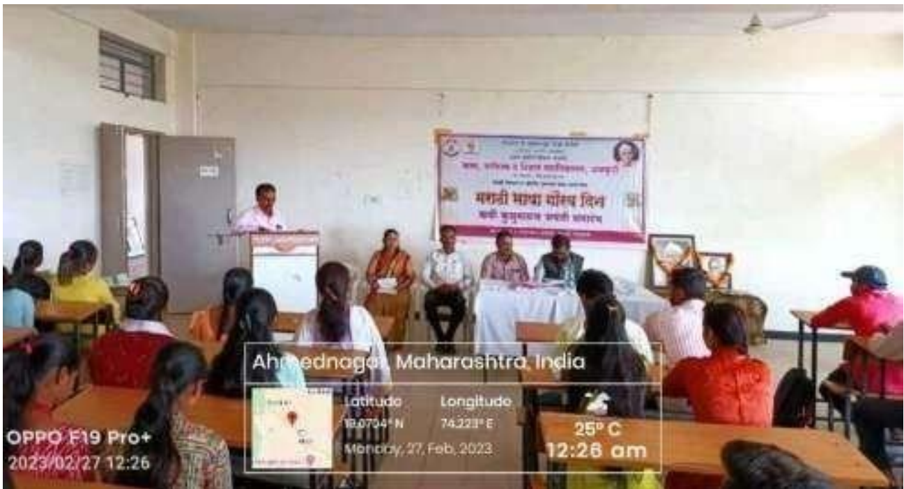
Chief Gest Guide to the Students.