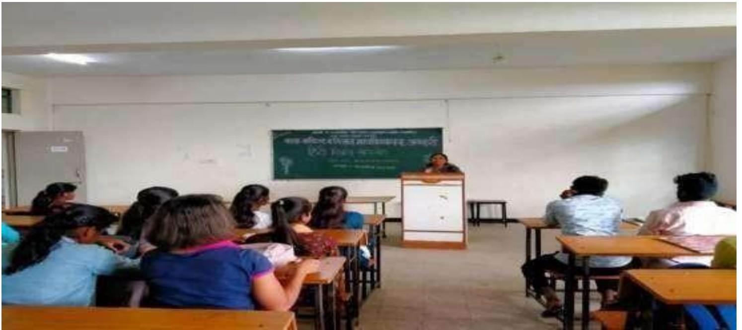
Chief Guest Guide to the Students.