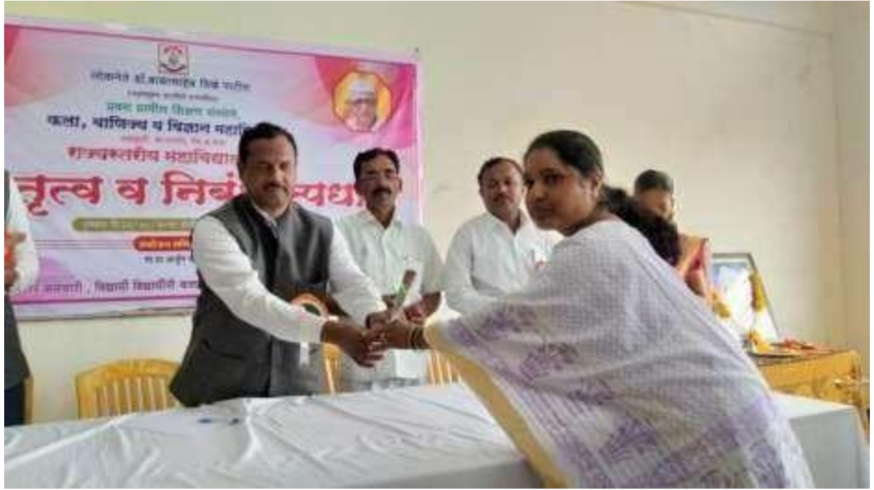
Marathi- Hindi State Level Competition