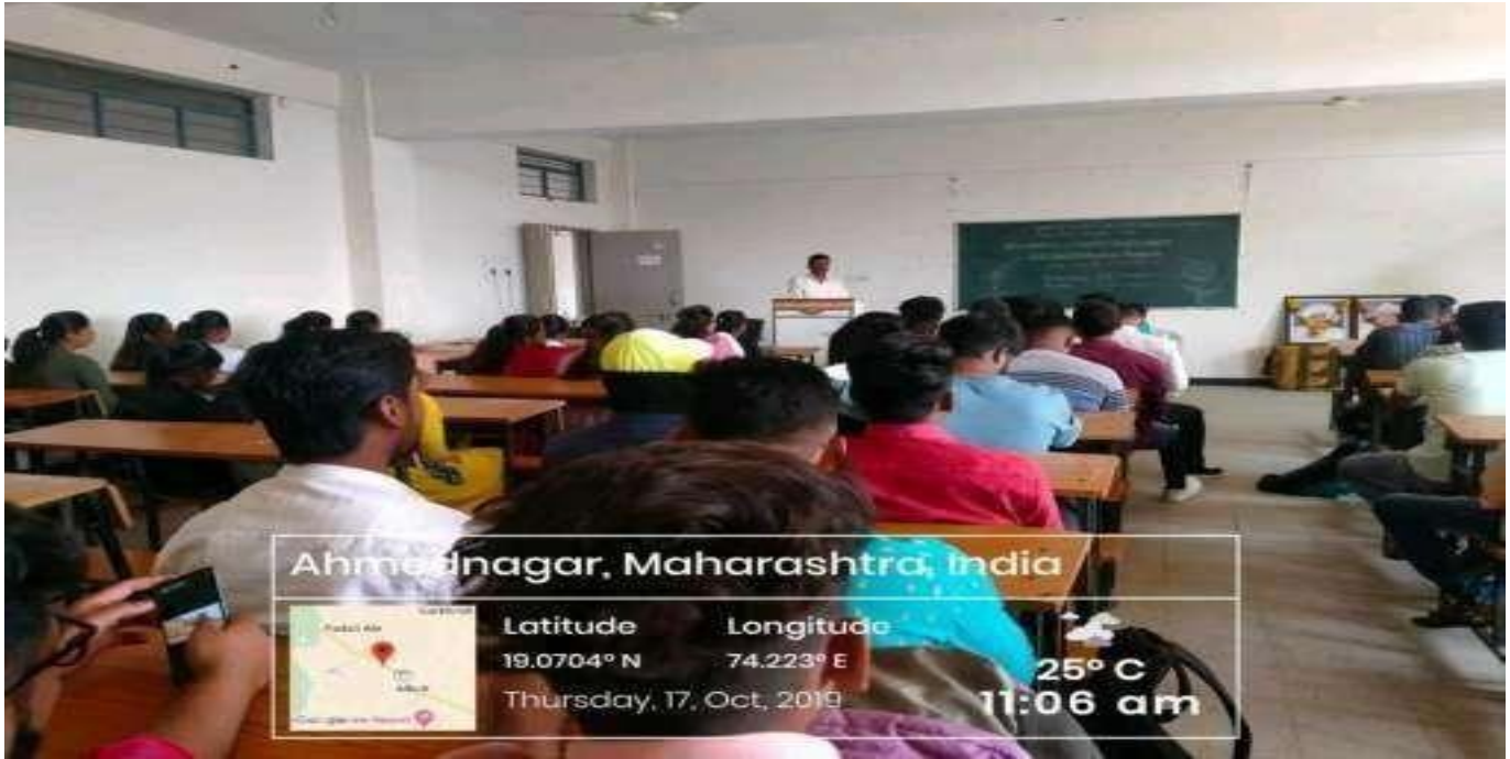
While Guiding the Chief Guest to Students.