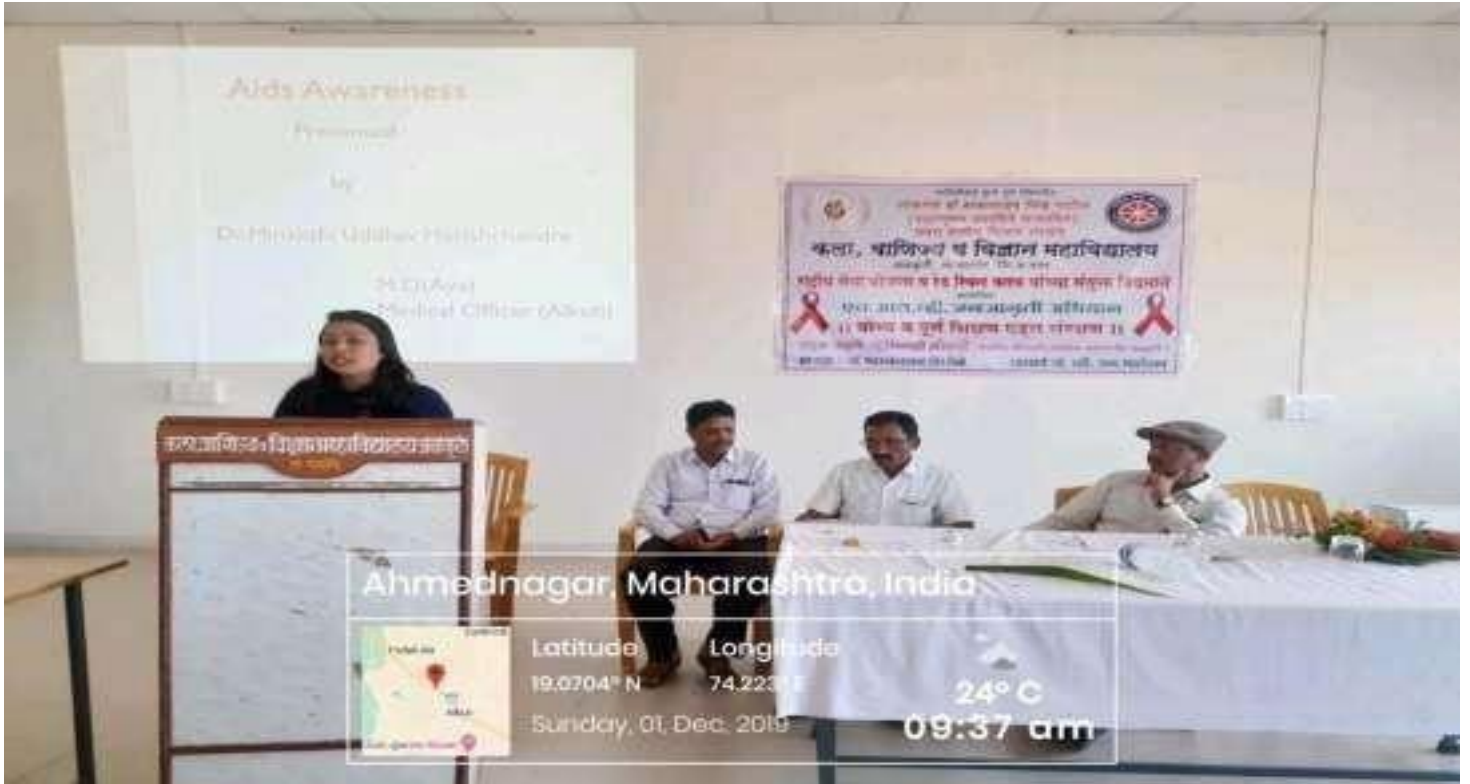
Aid Awareness Programme