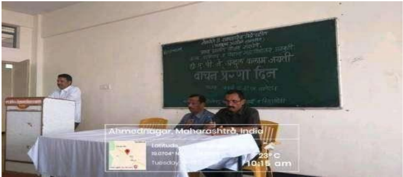
Inauguration of Vachan Prerna Din