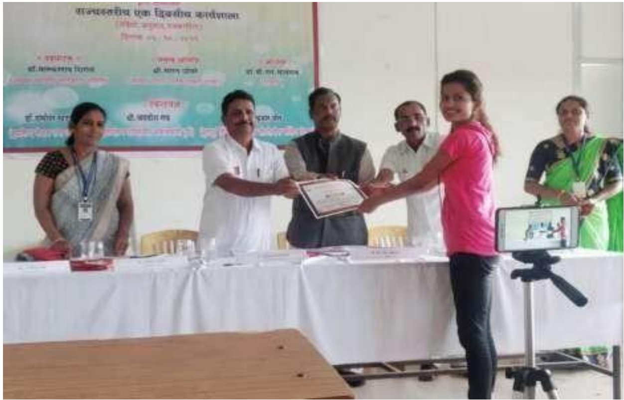
Prize Distribution Essay Writing Competition