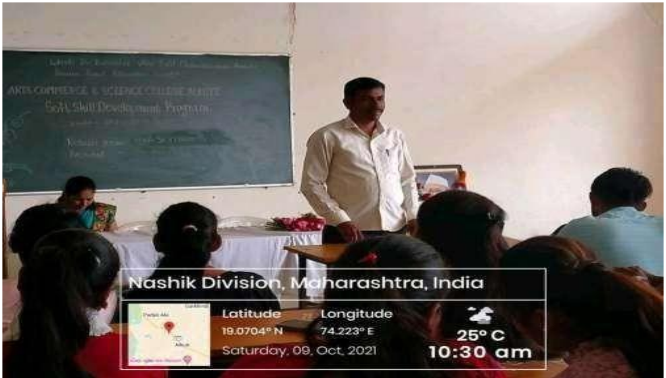
Soft Skill Development Programme