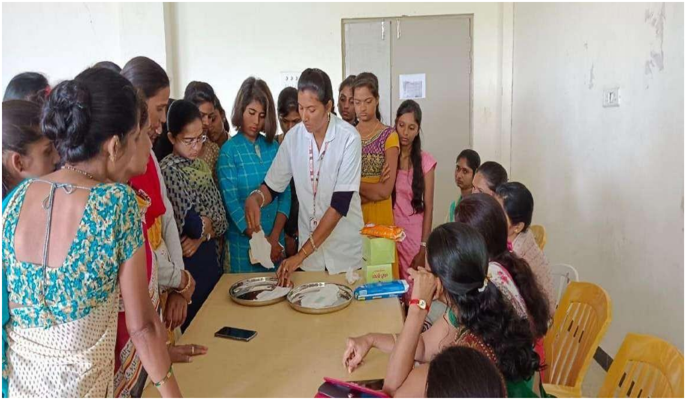
Nari Shuraksha Programme