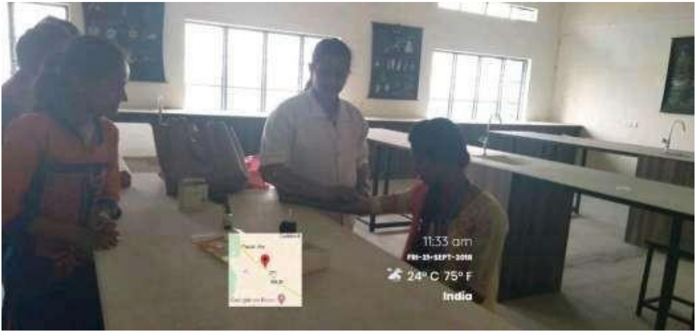
Hemoglobin Checkup Programme