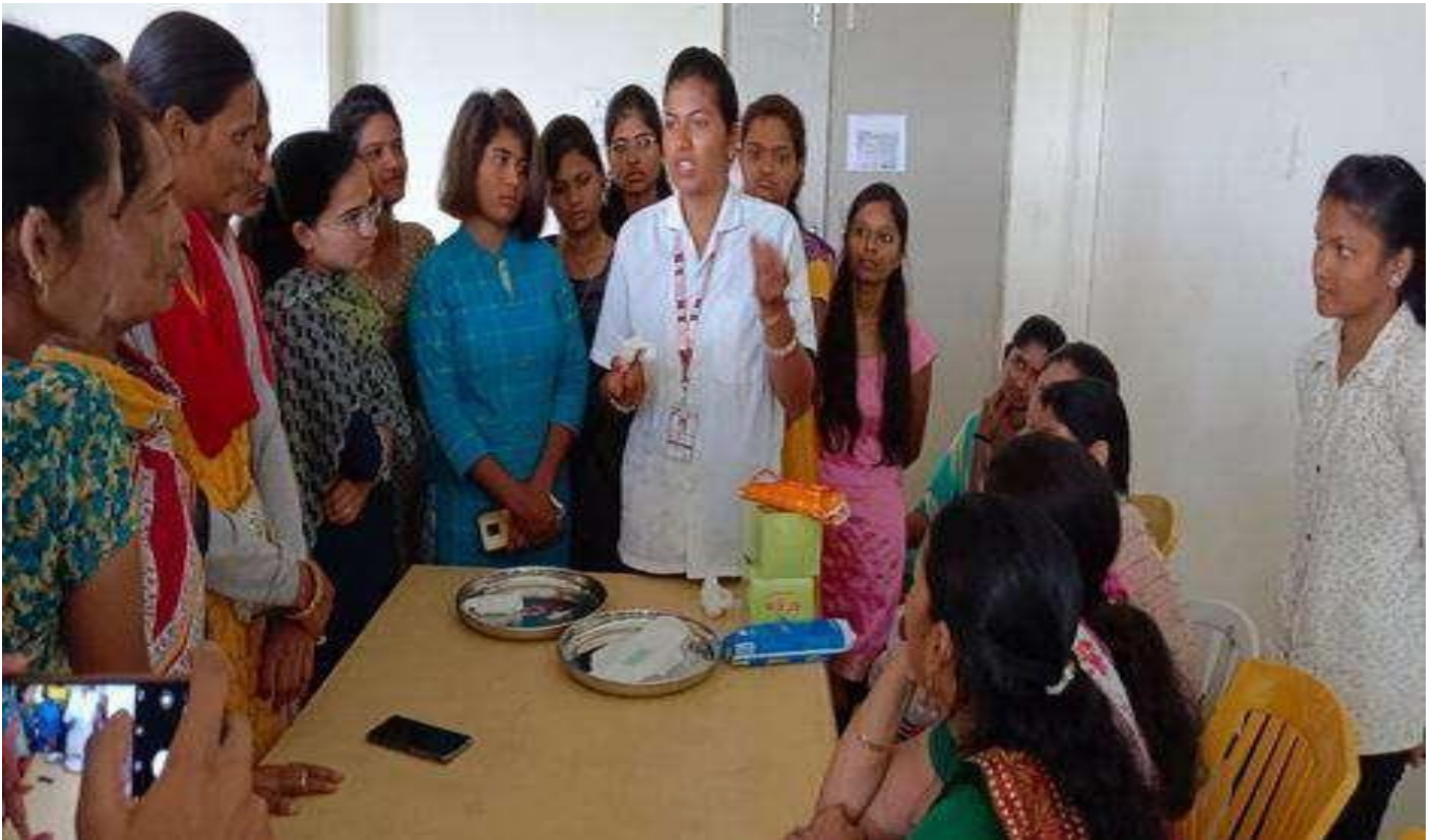
Demo and use of sanitary Napkin