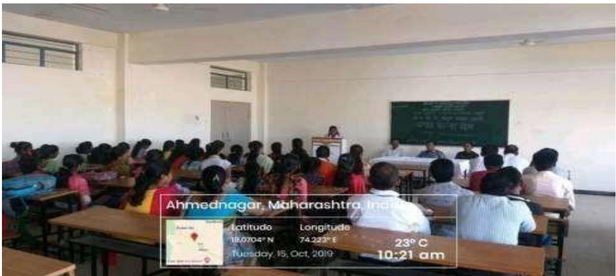
Student expresses her views