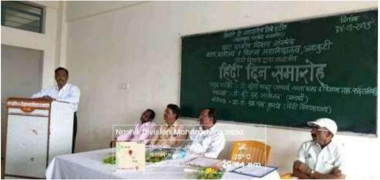
Hindi Day Program